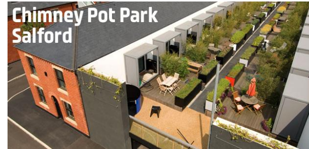
Wholesale change to built form to permit aesthetic retention with renewal and retrofit treatment