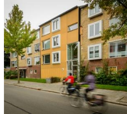
Dutch 'Energiesprong' initiative: houses are super-insulated using panel-facades that adhere to or replace external walls.