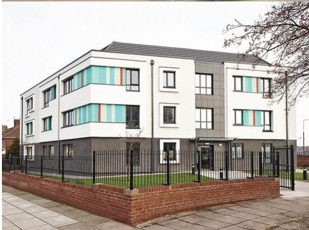
Post-change appearance of Liverpool flats gained Sustainable Housing 'transformation award' in 2014.