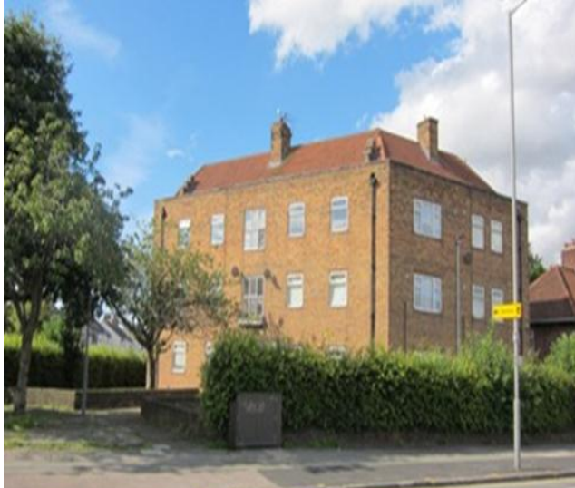
Original appearance of Liverpool flats.