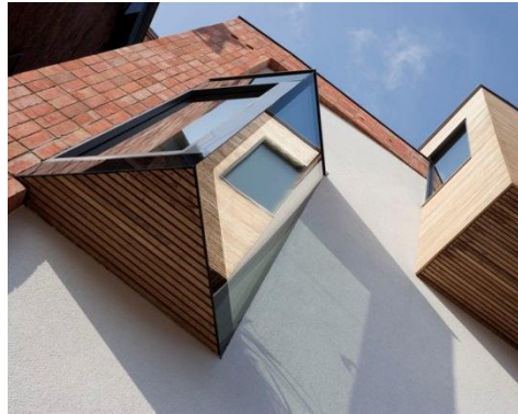
Birmingham Zero Carbon House Substantial innovative change to built form to accentuate aesthetic fit with retrofit treatments