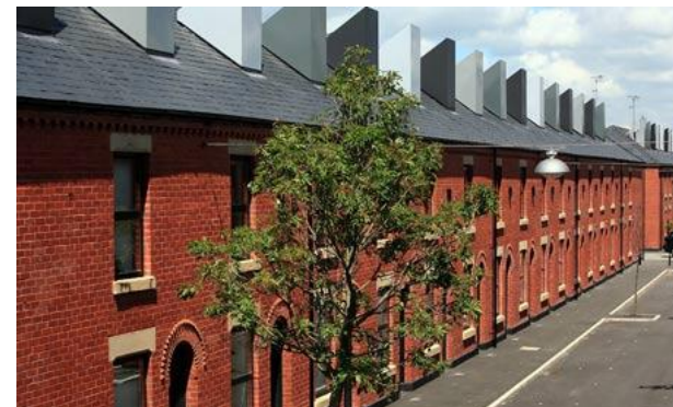
Final built form shows limited change of original character of streetscapes