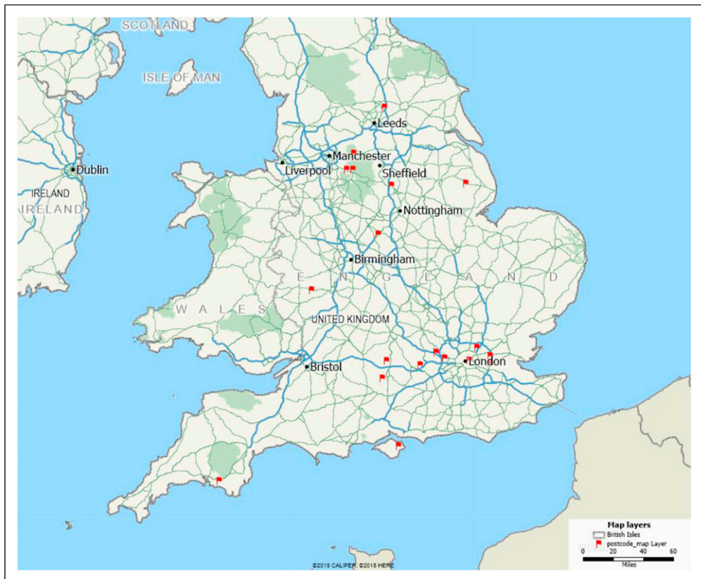
Figure 1. Geographical spread of participants who took part in the Delphi study. This image was produced by the research team using Maptitude 2019 (Calibre Corporation).

Statistical analyses. In addition to the rich qualitative data to support the formation of each statement, we wanted to explore whether there were any significant differences in the ratings given by those with YOD versus family supporters following Round 2. The distributions of the ratings for all 29