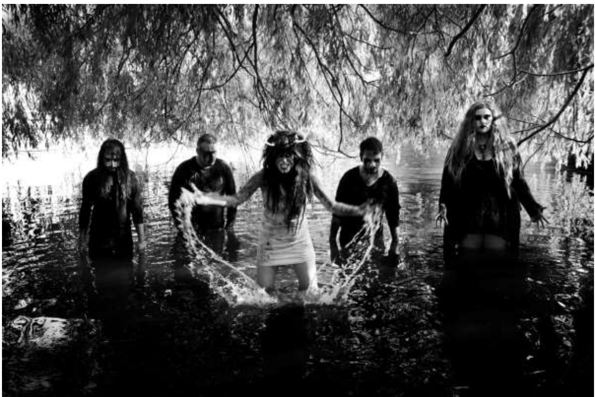
(fig. xxviii) Denigrata's album photograph by Ester Segarra, 2015.