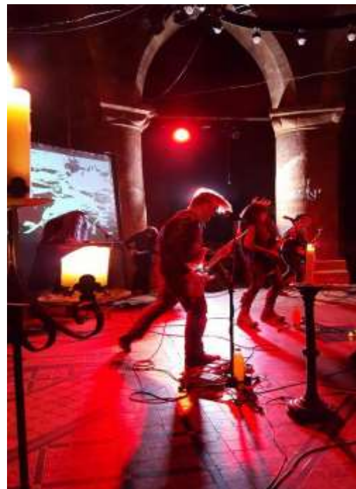
(fig. xxvi) Album launch image