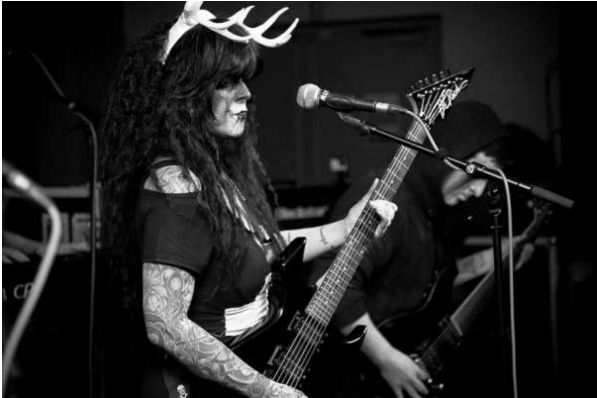
(fig. i) Denigrata Herself.