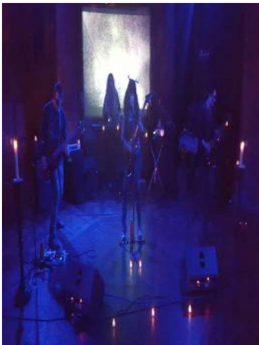
(fig. xxv) Album launch image 1. 2015. 2. 2015.