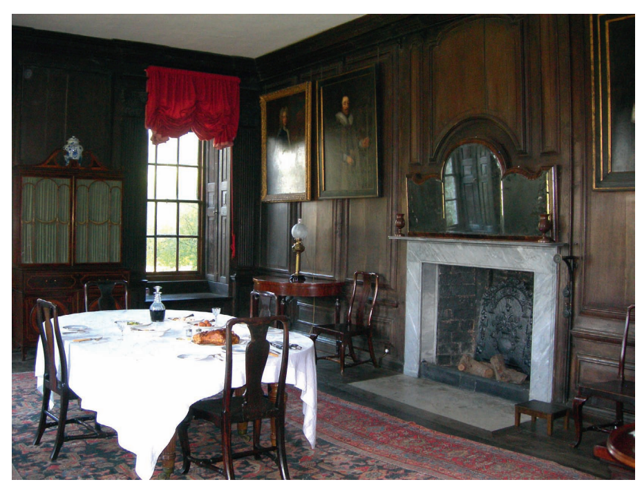
2 The Dining Room, Canons Ashby.