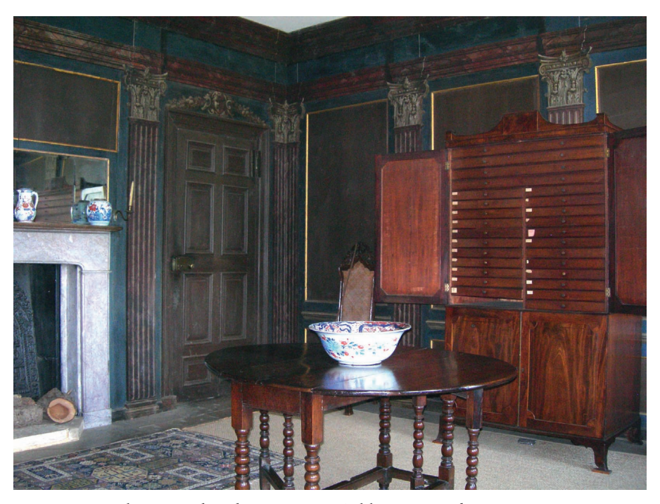
3 The Painted Parlour, Canons Ashby.