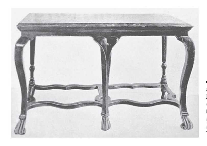
6 Sideboard made en suite with the chairs in Figure 5.