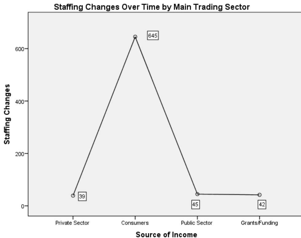
Figure 1 – Staffing Levels and Main Sector of Trade:

NB. The staffing changes figures in the above graph are estimated marginal means as calculated in SPSS.