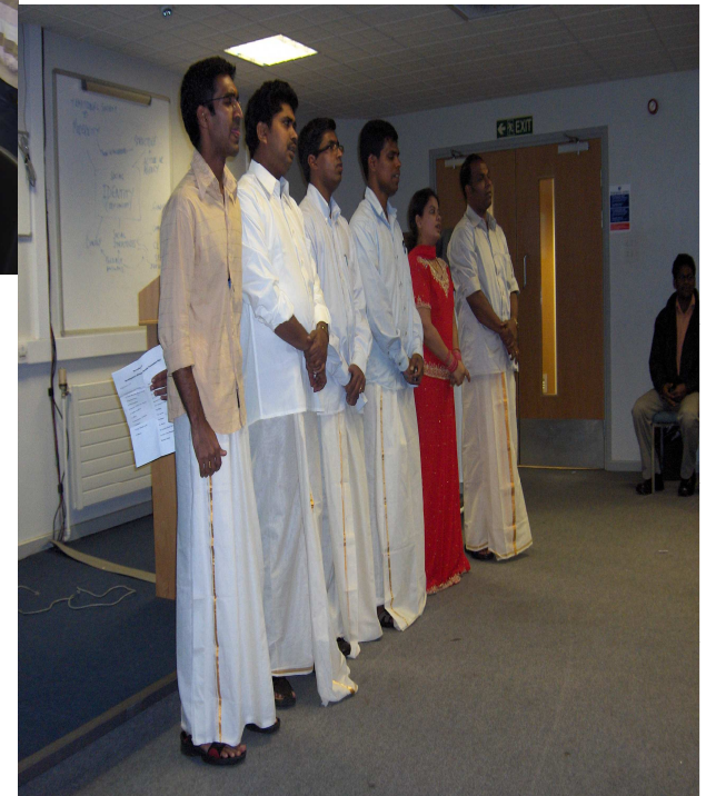
An Indian day