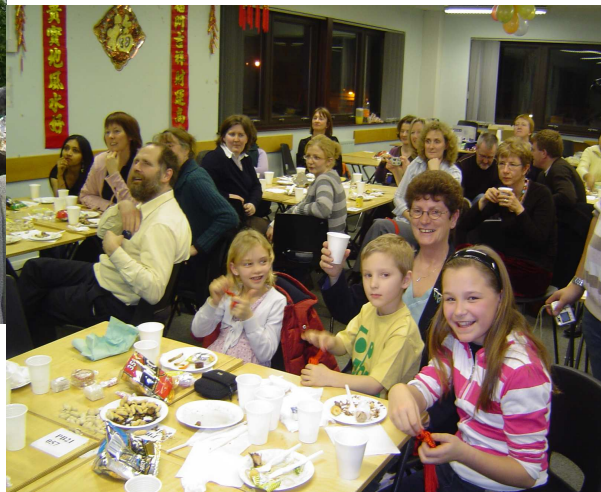
Chinese New Year party