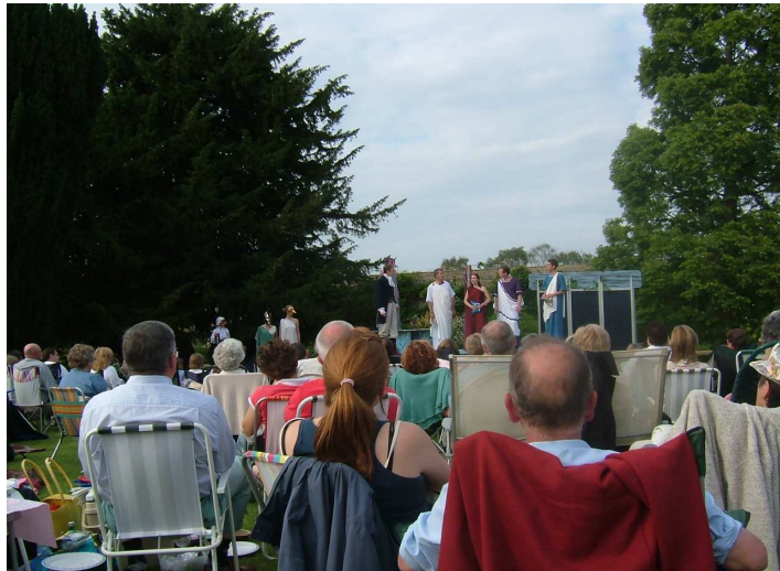
A Mid-summer night's dream