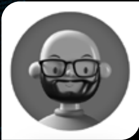
Omer IT Department Records Merger 0.6 Organisational FTE