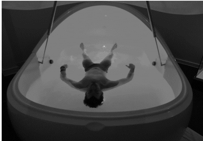
Figure 1. Example of Receiver inside the tank (lid open and lights still on for photographic demonstration only – lid closed and safety light off during each trial)

A clipboard containing lined and plain paper was used for the writing and drawing of impressions following every session. Telephones were also required for contact between the two experimenters to inform of the start and end of each session. For the sender, access to a laptop and the Dalton video clips (Dalton, Steinkamp & Sherwood, 1999) was required.