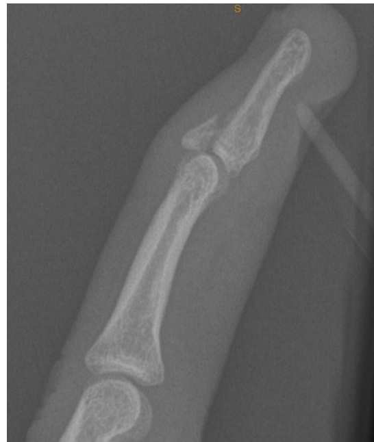
Fig. 1. Lateral x-ray of ring finger: large dorsal avulsion fragment at insertion of Extensor digitorum longus (EDL) following catching injury

Most English professional cricket seasons last an average of 22 weeks. Therefore, a club might expect to endure 92 % of the season with playing selection reduced because of a hand injury. During the ten-year period, Northamptonshire had an average of 25 senior players available for selection across three formats. Hand injuries reduced this capacity by 4%.