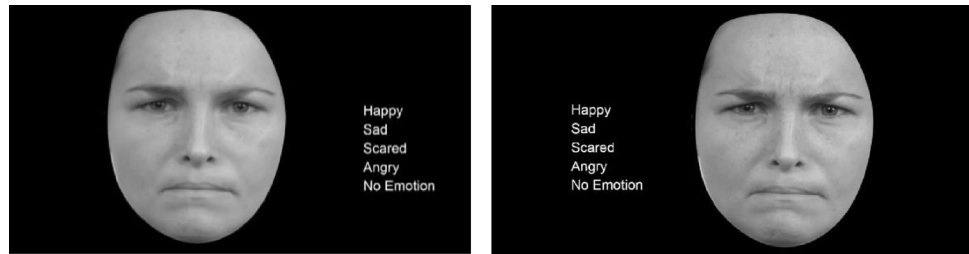
Fig. 1 Example of a low (left) and high (right) intensity angry face from the FER task