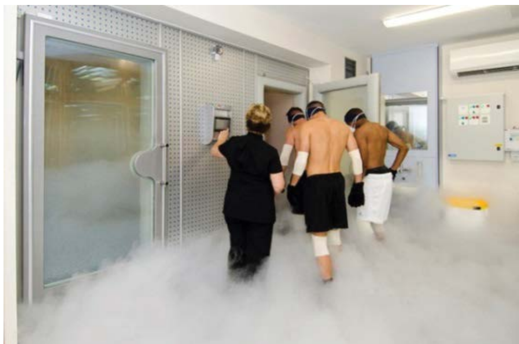
Figure 1: An example of a whole-body cryogenic chamber treatment (Chris Moody Rehabilitation Centre, Moulton, Northamptonshire), typically utilising liquid nitrogen as the coolant, with temperatures set at -110\text{ }^{\circ}\text{C} to -140\text{ }^{\circ}\text{C} .

notably hydration, nutrition, electrostimulation, stretching, sleep and massage [2,3]. One emerging recovery tool is cryotherapy which involves cold temperatures to reduce swelling and soreness. Sports personnel are familiar with the practice of ice baths or cold-water immersions (CWI), the use of which has been extensively reviewed [4,5]. However, the recent emergence of the extreme cold present in whole body cryotherapy chambers or 'cryosaunas' has added an additional tool to sports recovery practice.