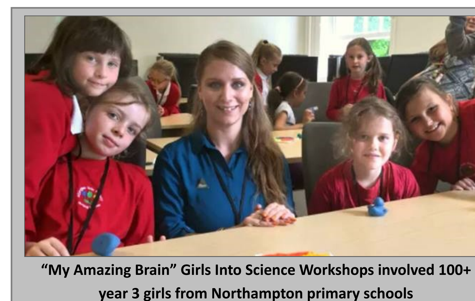
"My Amazing Brain" Girls Into Science Workshops involved 100+ year 3 girls from Northampton primary schools