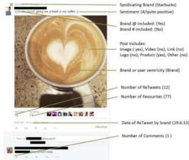
Figure 1. Mapping of Classification Data Points